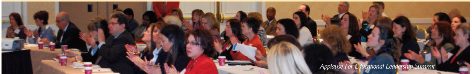
Applause For Educational Leadership Summit

VP Marketing, Guiding Eyes for the Blind