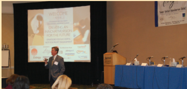
HRG Chairman Addresses Educational Summit

"Thank you for an excellent event. What a great day of knowledge, networking, food and drink! HRG runs a top notch show. I made many good connections."