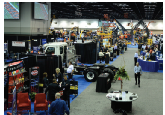
United Rentals 2014 Annual Strategic Suppliers Show, Indianapolis Convention Center, Indianapolis, Indiana