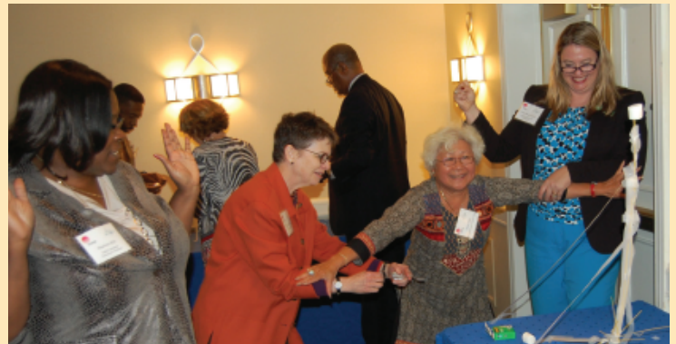
Summit attendees join in team-building exercise

Attendees participated in lively discussions, seminars and workshops offered by HRG's Strategic Training Solutions, along with industry experts in grant writing, innovation leadership and health benefit management. HRG led a panel discussion on Best Practices and Partnerships for innovative event strategies.